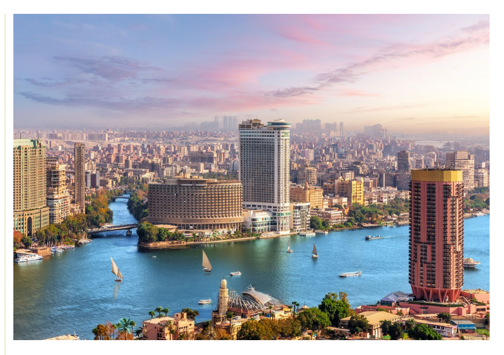
COP 27 was held in Egypt in November and saw the creation of a 'loss and damage' fund.

These events have contributed to an improved outlook for global inflation. But as fears of runaway inflation subsided, fears